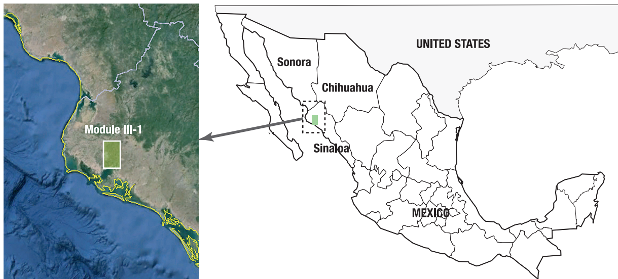
Figure 1. Irrigation module III-1, “Santa Rosa” localization.

temperatures ( ^{\circ}\text{C} ) and duration of the season-duration cultivar (short, medium, long). To build the models, historical data of ten crops were obtained from one irrigated zone in Sinaloa Mexico, developing the experimentation in realistic conditions. In the results section, we present the best CYP technique for massive crop datasets and the most influential attributes for each model.